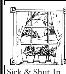
Sick & Shut-In